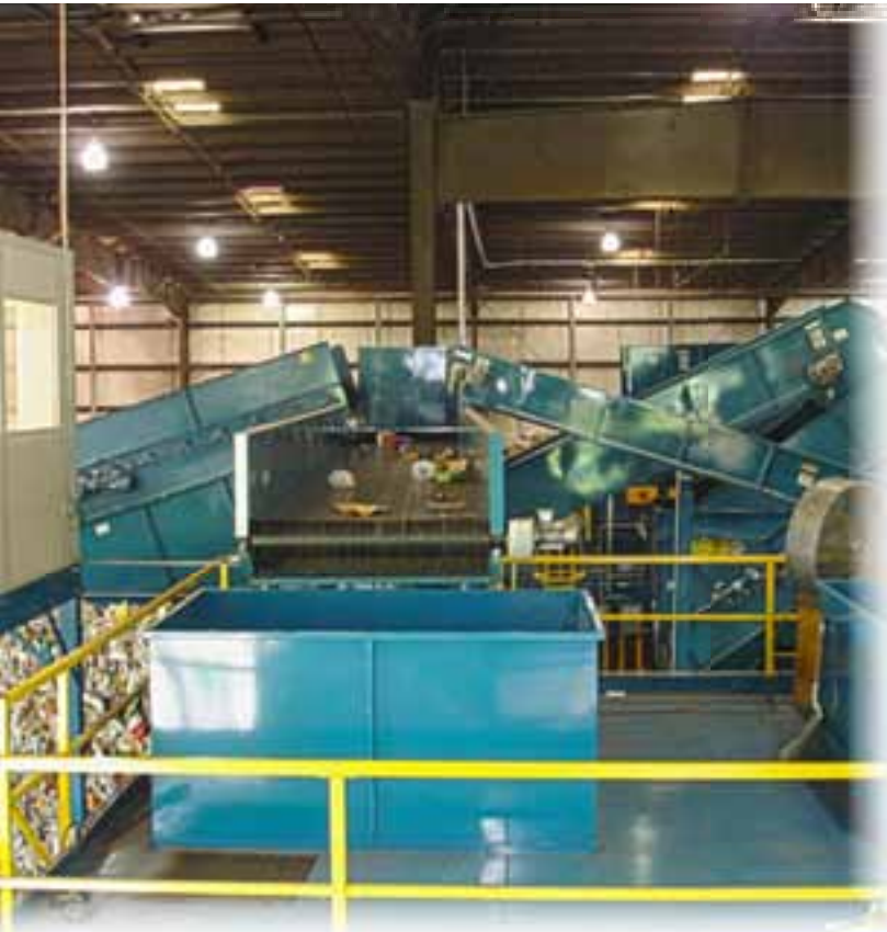
Material Recovery Facility, City of Conway, AR