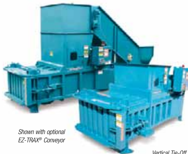
Shown with optional EZ-TRAX® Conveyor

Standard Features: Full penetration ram for maximum compaction and full bale ejection. Programmable, UL Listed controller permits automatic or manual operation. Twin cross-cylinders with 20 HP motor deliver 34-second cycle time. Bale size 30"H x 48"L x 60"W. Wire guides for quick and easy ties.