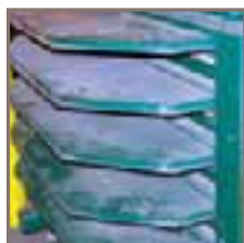
The wire guides direct the bale ties from the front, around the bale, and back to the front, eliminating the need to go behind the unit.

Standard Features: Patented bale server island boasts quick and easy bale removal and wire guides for front bale tie-off, and eliminates trips behind the baler. Bale Made light signals when the bale is ready to be ejected. Serrated body shear blades. Bolt-on, adjustable, and replaceable ram shear blades. Spring-loaded retainer locks for springback control. Chute feed hopper with inspection door and interlock switch. Hydraulic door latch (not standard on 620E). Programmable controller. Advanced power pack design.