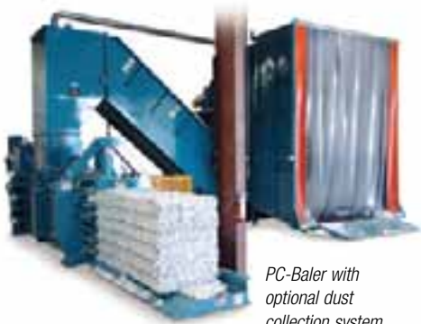
PC-Baler with optional dust collection system and in-feed conveyor

TIEger Auto-Tie Balers are precision built by our manufacturing specialists and feature the exclusive TIEger Tying System. This system uses highly efficient gear twisters, which means there are no twister hooks and no pigtails. This results in more than a 10% reduction in wire consumption and related costs! Hydraulic wire positioners precisely align the wires for pick-up by the inserter needles, making the TIEger the most reliable tying system on the market.