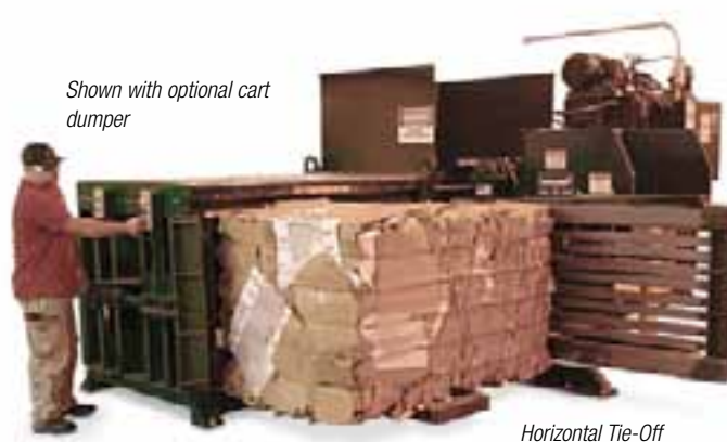
Shown with optional cart dumper