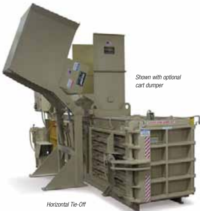
Shown with optional cart dumper

Standard Features: Gear-style bale length actuator activates the Bale Made light automatically, with no flag pole to engage or disengage. Photocell for automatic cycling. Heavy-duty, spring-loaded retainer locks. Reversible and replaceable ram shear blade. Serrated body shear blade. Programmable controller. Chute or hand-feed hopper. Heavy-duty power pack with 20 or 30 HP TEFC motor and key-operated start on/off switch. 460 volt with power disconnect switch. Center position valve. 10 micron return line filter and 100 mesh suction line strainer. Audio/visual start-up alarm.