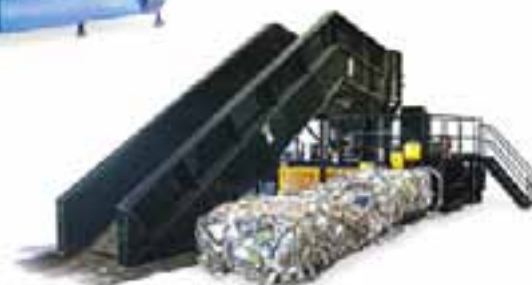
Shown with optional EZ-TRAX® Steelbelt Conveyor