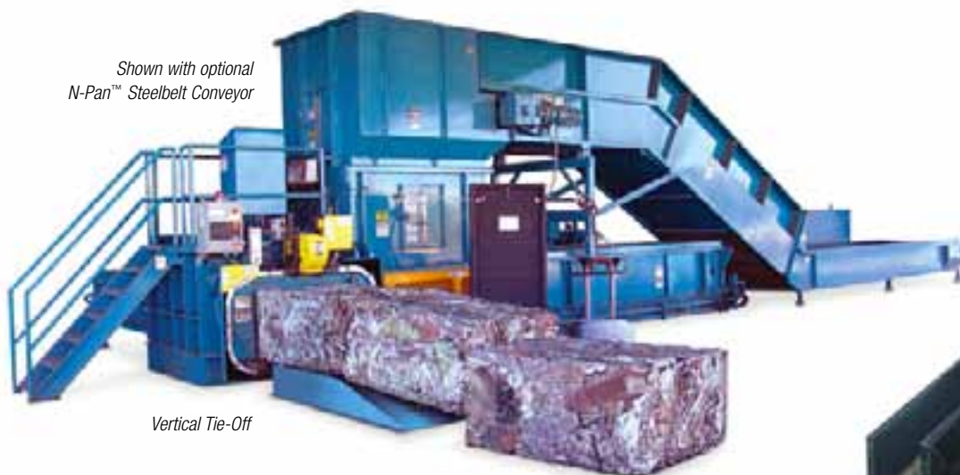
Shown with optional N-Pan™ Steelbelt Conveyor

The GALAXY 2R Two-Ram Balers feature a combination of the latest electronics technology and advanced structural engineering to make the most powerful and efficient balers available. With the heavy-duty design of the bale chamber and full-penetration compaction ram, the GALAXY produces higher density bales. The programmable controller enables you to easily switch recyclable materials. With the metals package, the GALAXY is great for scrap applications.